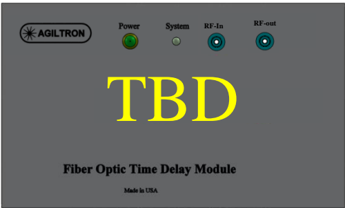
Front Panel (TBD)

(Typical 6RU 19' mount rack for the customized 16 ~19-bit delay system)